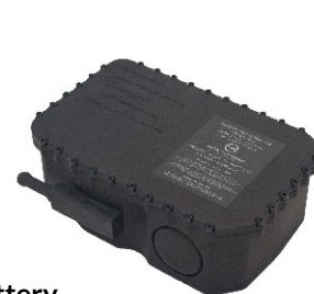
37Ah Battery Dry Weight: 13.25 lbs (6.01 kg) Wet Weight: 6.80 lbs (3.08 kg) UN Tested/ Approved *AMU Approved