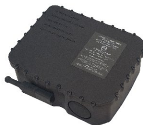
50Ah Battery Dry Weight: 16.75 lbs (7.60 kg) Wet Weight: 7.63 lbs (3.46 kg) UN Tested/ Approved